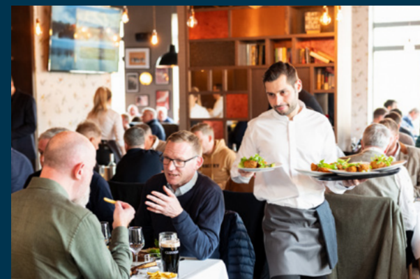
THE CRANE TAP